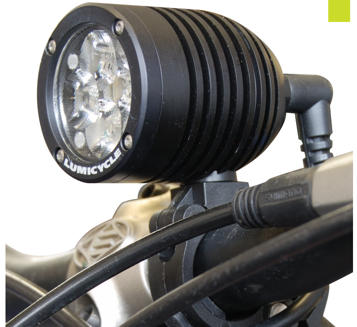
LED4 Head (Spot optic)

Run times may vary depending on LEDs and battery age